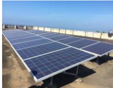
Solar Energy Plant

Using Solar Energy, Sree Narayana Training College prides itself on keeping greenhouse gas pollution out of the atmosphere. Rainwater harvesting is an important environment friendly approach the College has been implemented to meet the scarcity of water and avoid destruction of the normal groundwater level. In collaboration with Kerala State Council for Science Technology and Environment (KSCSTE), the college organizes activities in association with World Environment Day, World Wet Land Day, World Ozone Day and National Science Day with a view to disseminate knowledge of environmental hazards among prospective teachers. Our college has good interaction and collaboration with the environmental activities of University of Kerala under the Bhoomitrasena club. The Club has convened an awareness class on conservation of water in association with World Water Day with the support of The Kerala State Environment and Climate Change Department. All these activities give rare opportunities to student teachers to protect our Mother Earth.