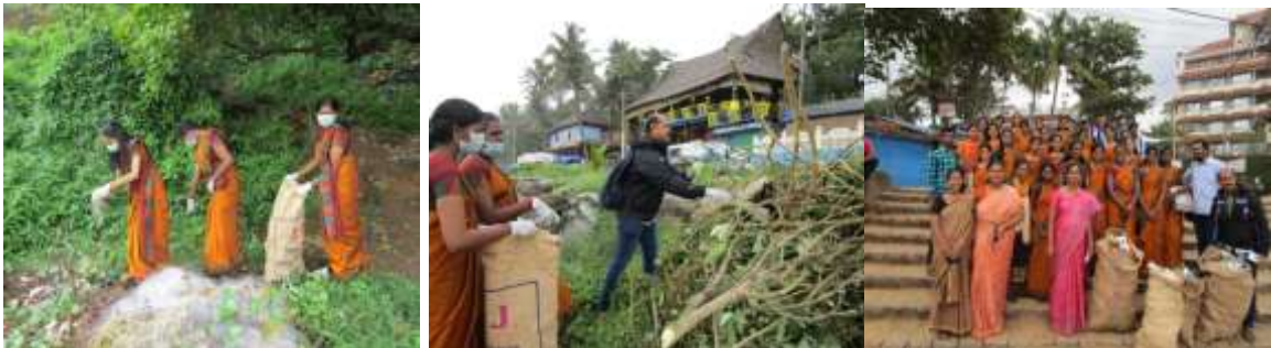
In Action- Challenge of eradicating plastic items from the Papanasam beach

Sree Narayana Training College engages in different activities which are for sustainable environment with Greenvein, a National foundation for planting and protecting trees. The organization aims to reduce global warming and implement reforestation programs all over the country. For the past four years the institution collaborates with the organization and take up many programmes such as extensive afforestation programs throughout the locality and also take up the challenge of eradicating plastic items from the Papanasam beach, Varkala, where tons of plastic waste accumulates every time.