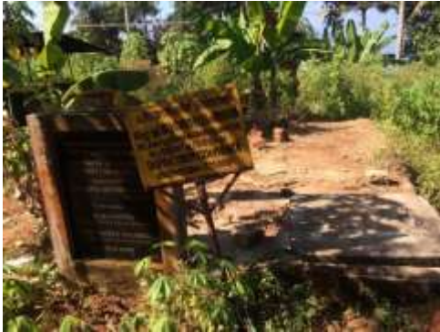
Rainwater Harvesting Unit

protection and preservation of natural resources in the respective schools as well as in the community. The initiatives were widely appreciated by the authorities, community leaders and PTA of schools.