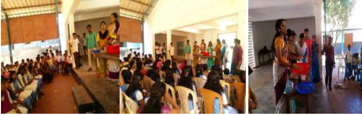
Student Teachers give training in Swadeshi Products preparation to nearby schools

Sree Narayana Training College engages in different activities which are for sustainable environment with Greenvein, a National foundation for planting and protecting trees. The organization aims to reduce global warming and implement reforestation programs all over the country. For the past four years the institution collaborates with the organization and take up many programmes such as extensive afforestation programs throughout the locality and also take up the challenge of eradicating plastic items from the Papanasam beach, Varkala, where tons of plastic waste accumulates every time.